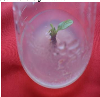
Fig. 2 : Shoot production in MS medium fortified with 4.00 mg/l BAP and 2.00 mg/l NAA

Means in a column followed by uncommon letter (s) varied significantly at 5% level of significance.